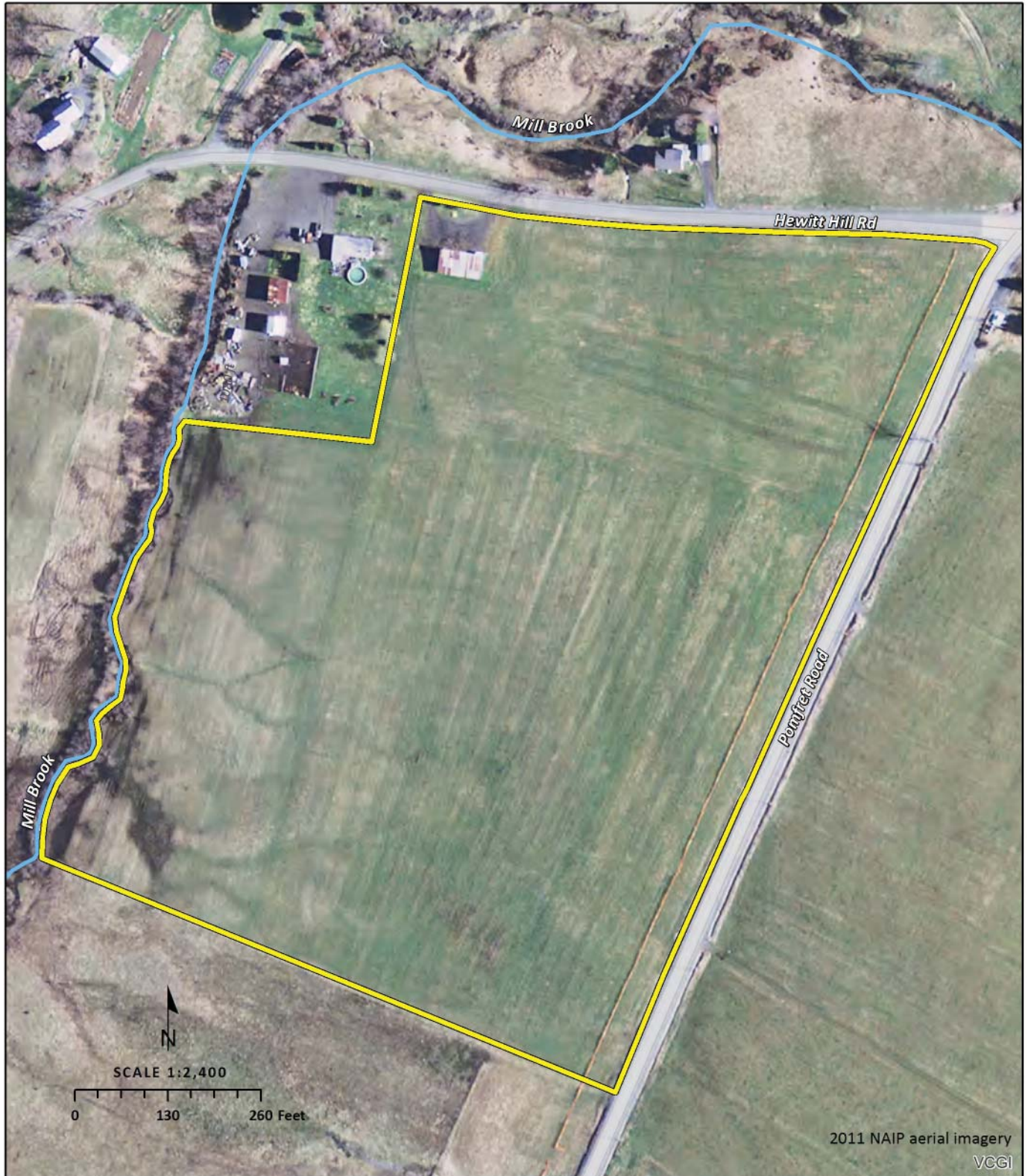
The 22-acre meadow at the corner of the Pomfret Road and Hewitt Hill Road contains outstanding agricultural soils. It is the last remnant of an original dairy farm in North Pomfret formerly known as the “Keck Farm.” Our conservation campaign will keep this land intact and productive for years to come.