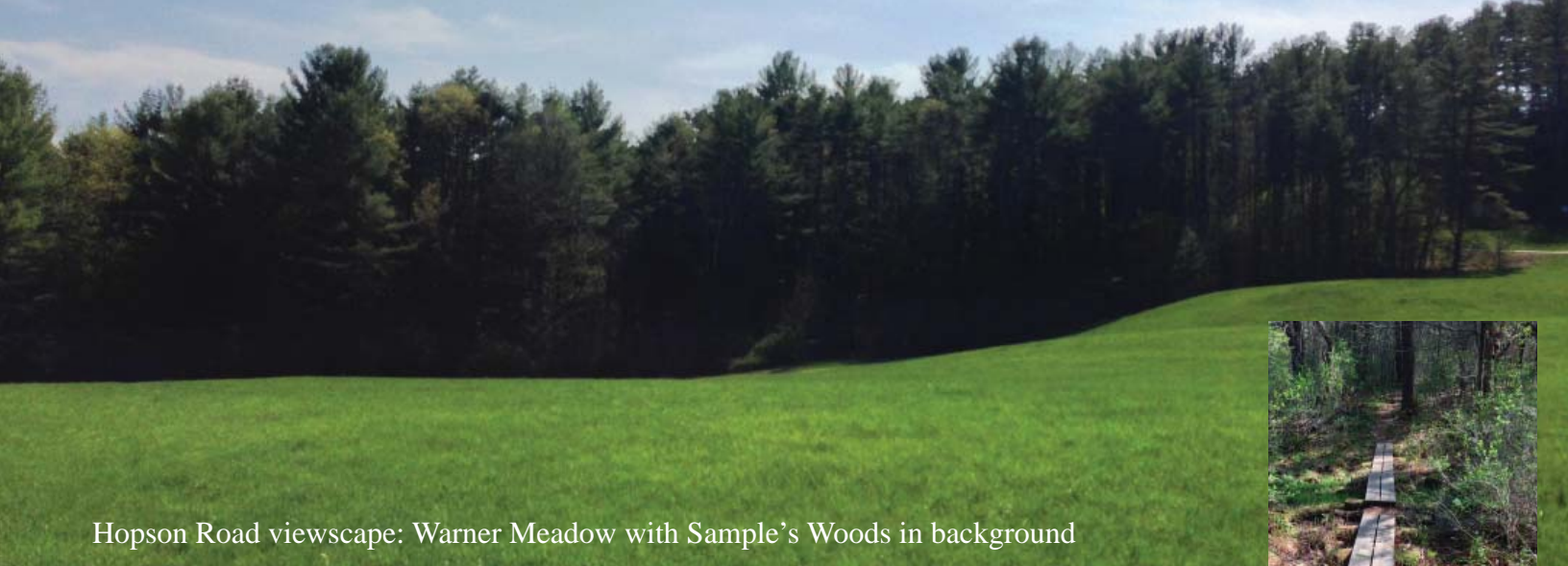
Hopson Road viewscape: Warner Meadow with Sample's Woods in background