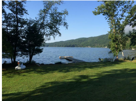
Lake Morey, Fairlee, Vermont

Address: 2690 Lake Morey Road, Fairlee, VT