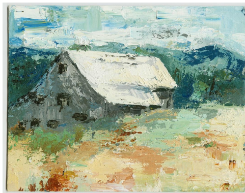
The Mountain View Barn Cards