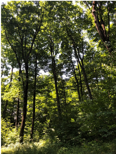
Sugar maples in the sugarbush at Old Town Farm.

Masthead Photo: Snow on pines.