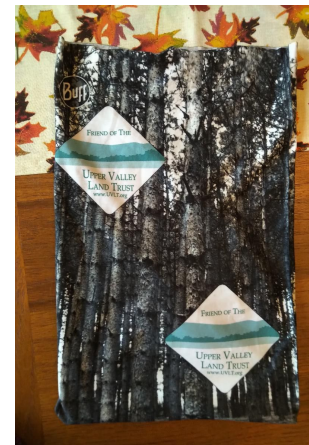
The Friend of UVLT Buffs