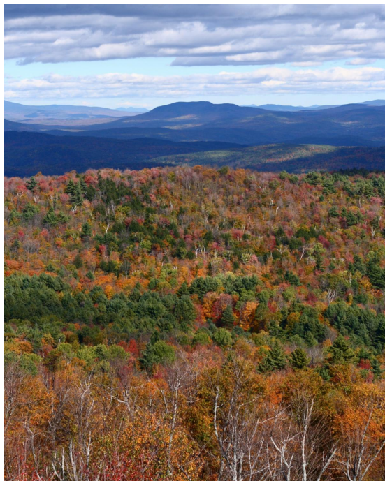
View from the Gile Mountain Firetower

Masthead Photo: Smarts Mountain from Trout Pond in Lyme, NH.