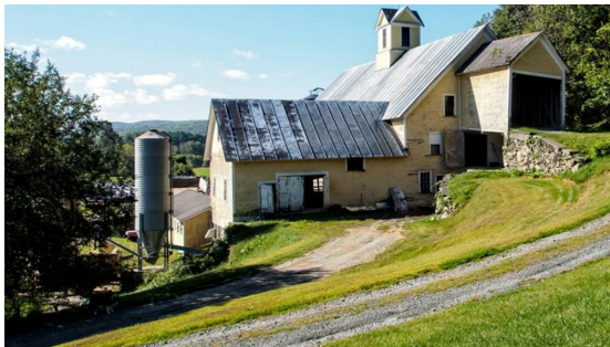
The Lemax Barns before restoration

In 2014, a group of Hartland residents came together to repair and restore the big yellow barns at the Lemax Farm and asked UVLT to serve as the fiscal sponsor for a local fundraising campaign. The partnership made sense, as years before UVLT had conserved the farm's hundreds of acres of river bottom farm land and forest. While the land was protected, the maintenance of the huge old farm buildings was tough. The historic buildings didn't fall under UVLT's preview for protection, but we were happy to assist the Friends of Lemax Farm community group by processing the contributions to restore the buildings.