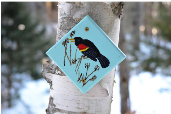
Trail markers at Zebedee Wetland painted by Thetford Elementary students

In the spirit of our Lyme Hill Activity Guide that was released in the spring of 2020, we have created a brand new activity guide for Zebedee Wetland! Students are back in school, but many local families still need safe and solitary activities for weekends and days off. We hope that this new guide will give you some ideas for how to spend a Saturday morning in the outdoors and will inspire you to create your own activities while visiting new conservation areas.